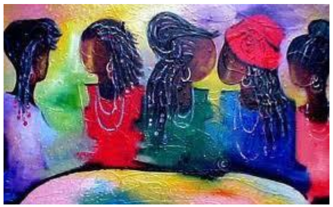
WOMEN'S DAY (March is Women's History Month)