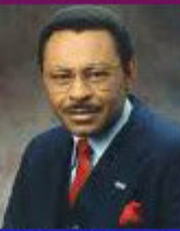
Roland Burris 2009-Present Rep. Illinois