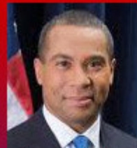
Deval Patrick Massachusetts 2007-Present