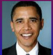
Barack Obama 2005-2008 Rep. Illinois