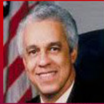
Douglas Wilder Virginia 1990-1994