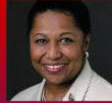
Carol Moseley Braun 1993-1999 Rep. Illinois