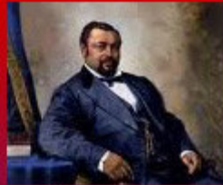
Blanche Bruce 1875-1881 Rep. Mississippi