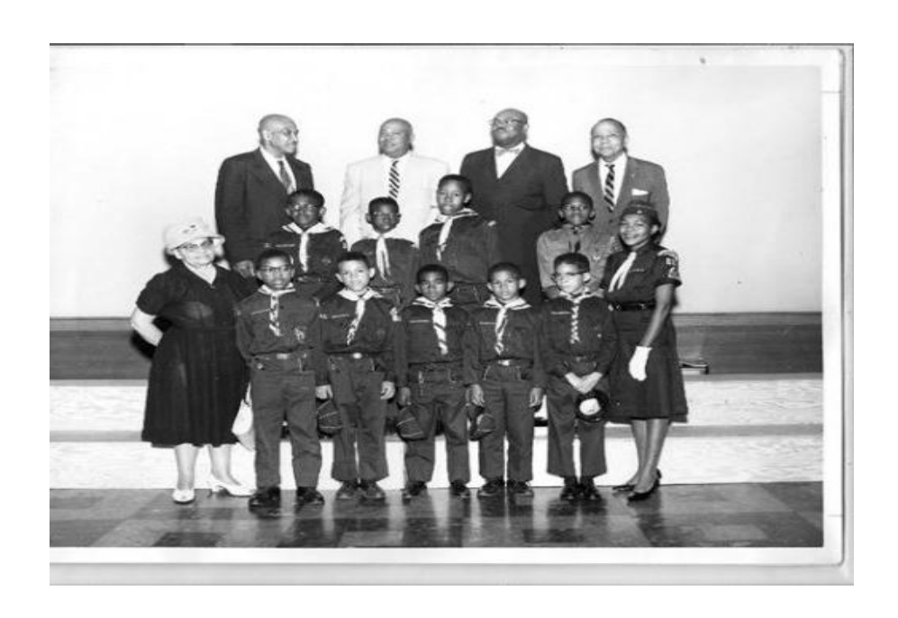
Cub Scout Troop 515, Metropolitan Baptist Church, Washington, D.C.