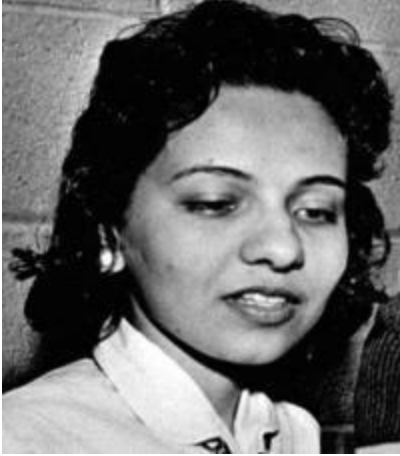
Diane Nash Bevel

Civil Rights activist and leader Diane Nash Bevel, a founding member of the Student Nonviolent Coordinating Committee (SNCC) had already served thirty days in jail in Rock Hill, South Carolina, before going to jail in Mississippi. She went to jail many more times during the Movement. She was an expert strategist in civil disobedience. Time and time again African Americans were unjustly jailed for upholding the right amidst the dangers they faced. Diane Nash Bevel took a stand. Being six months pregnant, facing a two-year sentence, and willing to deliver her baby in circumstances that could definitely be described as dangerous, she proceeded with divine guidance. Just as Jesus was delivered into an unfriendly world, so would this Bevel child be in hopes that generations to come would share in a more perfect Union. When questioned about her decision, she replied,