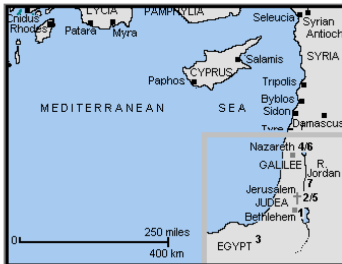
Map 1 - The Travels of Jesus as a Child and Young Man c 6BC-AD27

Another concept that we utilized was that we could risk being alive by doing as the parents of Jesus did and try to escape.